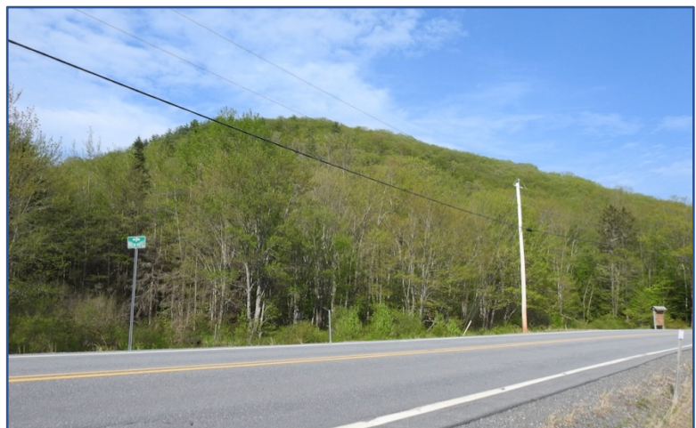
Bald Mountain from Route 123, May 2022